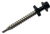
STAINLESS STEEL SCREW FOR CLAMPS 6.5 X 60MM + EPDM WASHER