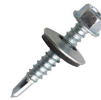
HEXAGONAL HEAD SCREW 6.5 x 25 MM FOR FIXING THE PLATE.